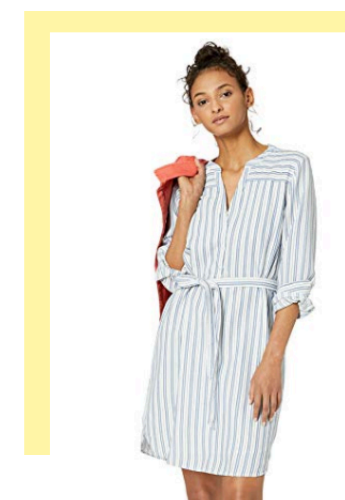
GIBSON Cozy Turtleneck 1.69% CVR