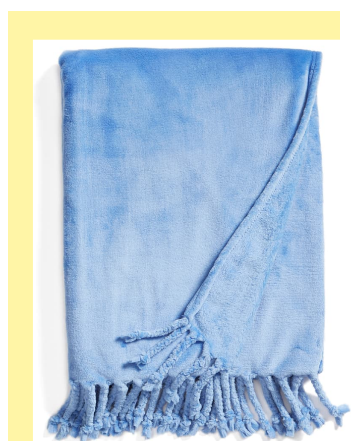
NORDSTROM Kennebunk Bliss Plush Throw 3.06% CVR