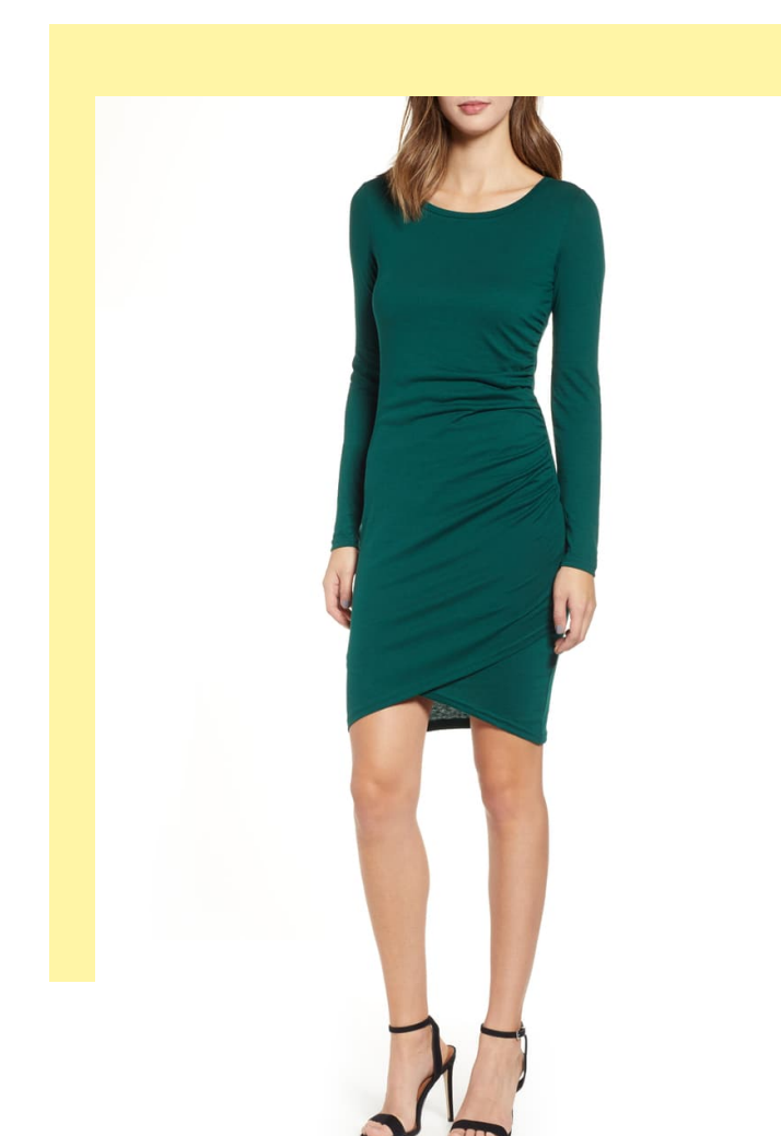
LEITH Ruched Long Sleeved Dress 1.86% CVR