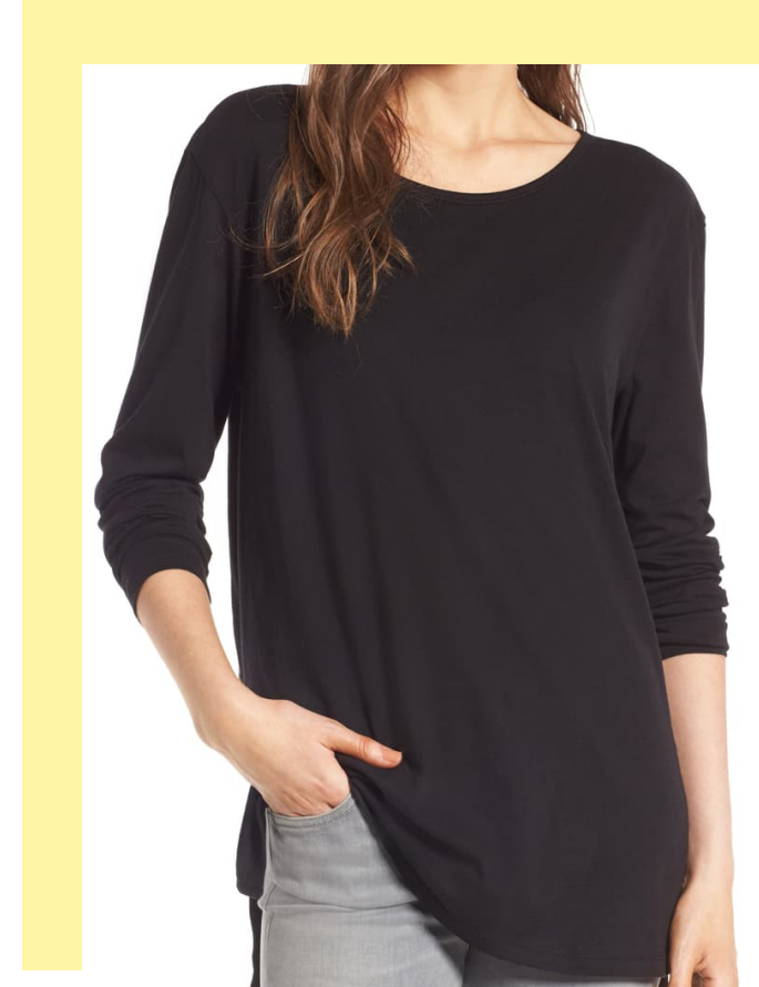
BP. Side Slit Tee 2.97% CVR