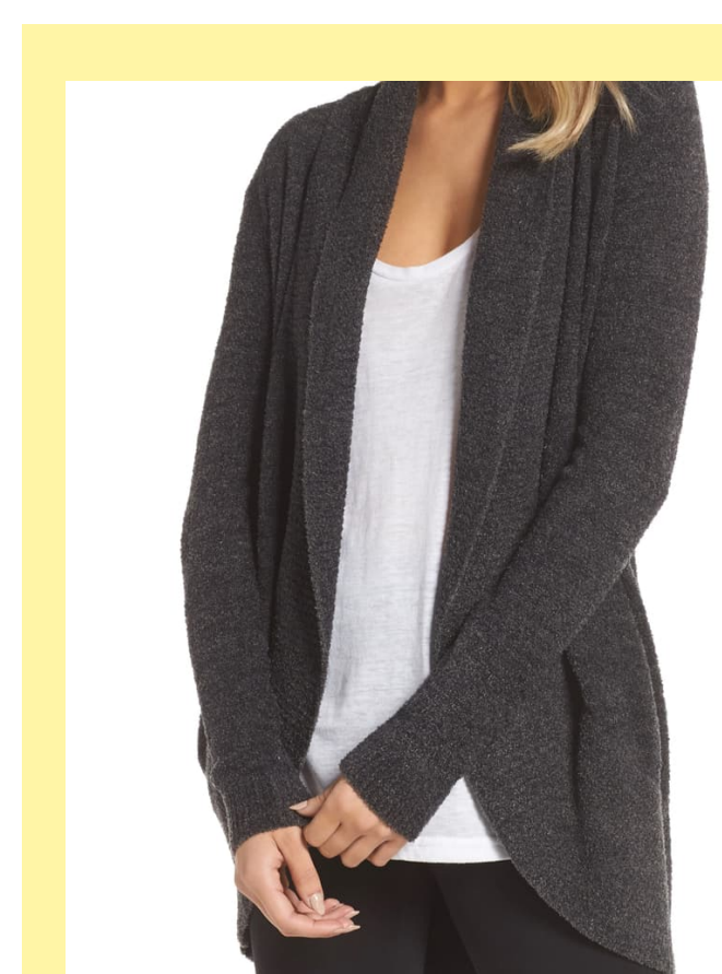
BAREFOOT DREAMS CozyChic Circle Cardigan 0.97% CVR