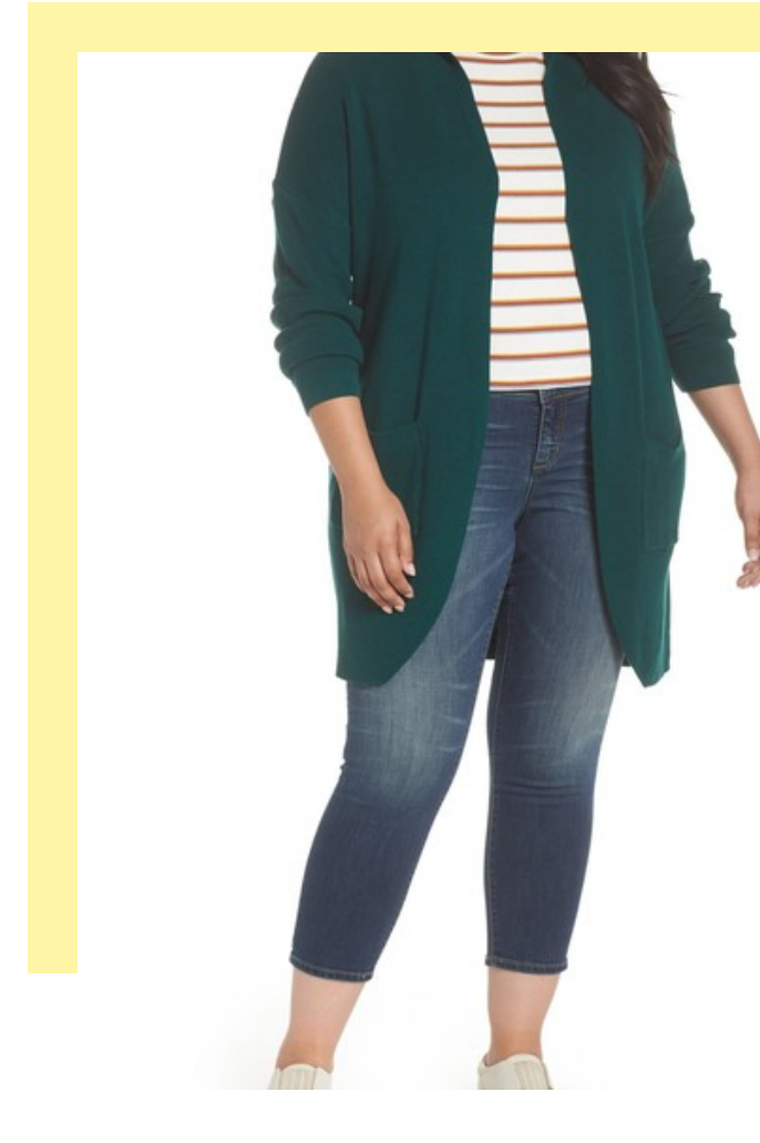
BP. Stitch Curve Hem Cardigan 1.09% CVR