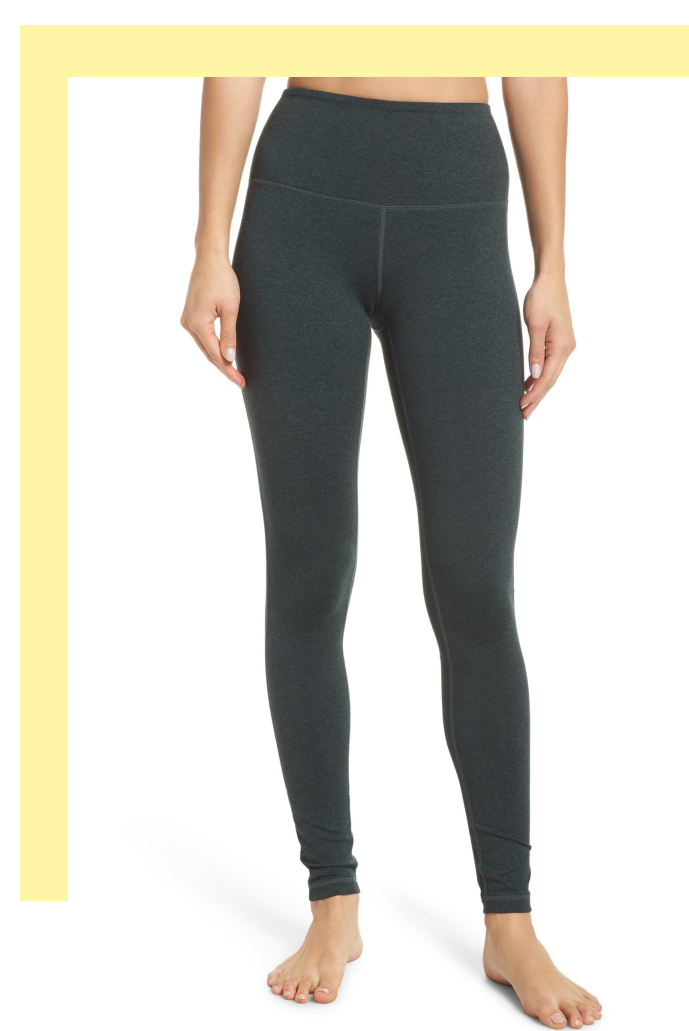
ZELLA Live in High Waist Leggings 1.49% CVR