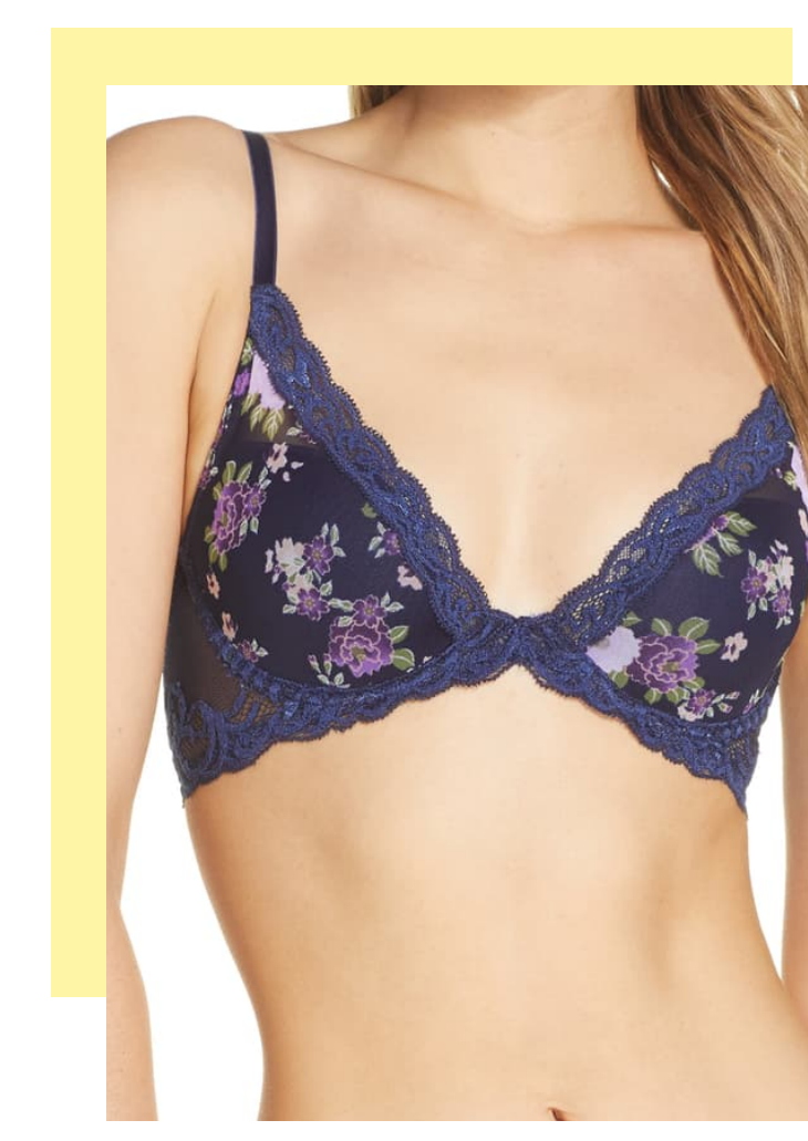
NATORI Feathers Underwire Contour Bra 3.27% CVR