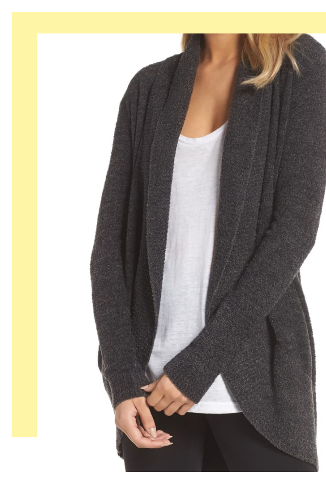
BAREFOOT DREAMS CozyChic Lite Circle Cardigan 0.94% CVR