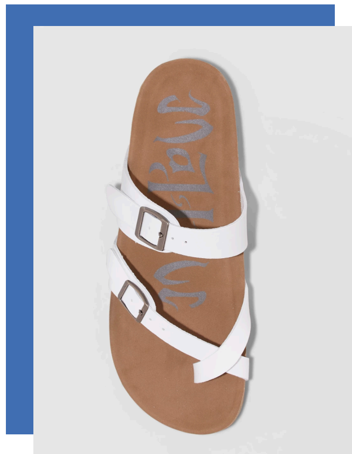
TARGET Mad Love Prudence Footbed Sandal 3.15% CVR