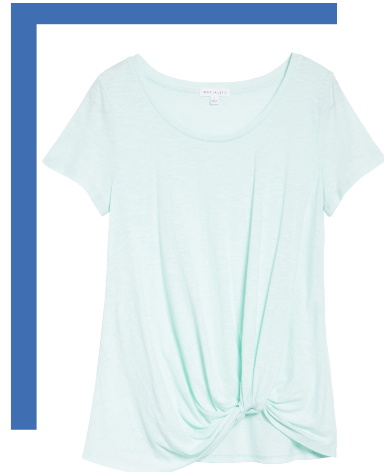
NORDSTROM BP. Twist Front Tee 3.58% CVR