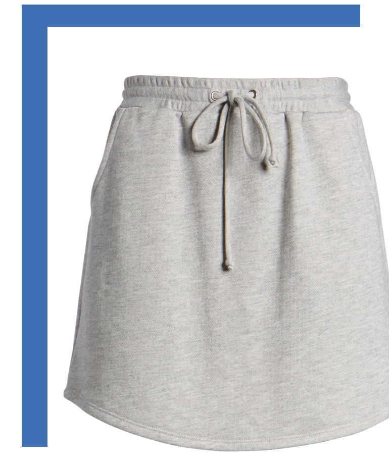
NORDSTROM Gibson x LIY Cassidy French Terry Skirt 4.07% CVR