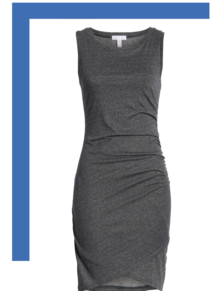
NORDSTROM Leith Ruched Body-Con Tank Dress 1.17% CVR