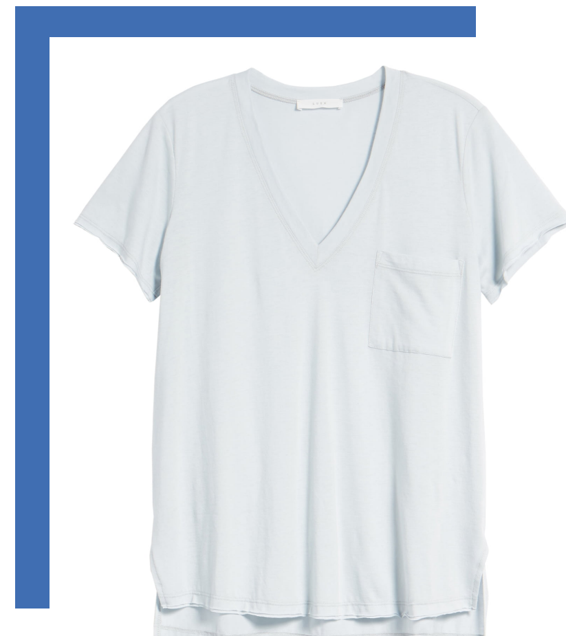
NORDSTROM Lush Raw Edge Side Slit Tee 1.77% CVR